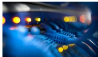
High Tech – 정보통신기기