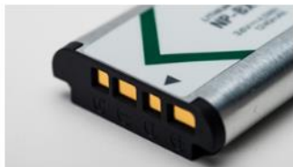
High Tech – 배터리