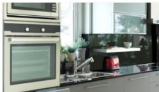
에너지 및 산업용 시스템