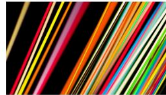
전선 및 케이블