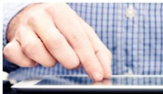
High Tech – 소비자전