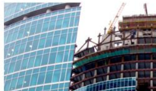
건축자재 및 감지, 방도 시스템